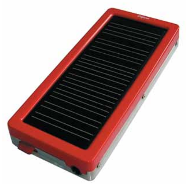
Digicel: RMK solar charger

As the charger is separate from the phone, and is provided with multiple leads, it can charge many different phone models. Furthermore, it can charge any other device that fits the leads provided, such as an LED light.