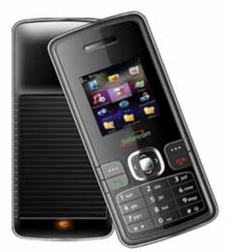
Safaricom solar phone

Digicel has taken a different route from Safaricom in that they will subsidise the cost of the solar handset for their subscribers. Digicel expects that the increase in ARPU that will result from the distribution of solar phones will justify their upfront investment.