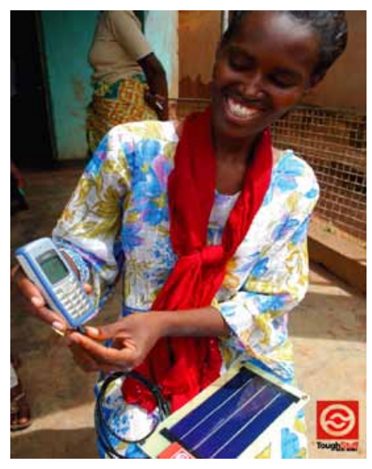
Toughstuff's solar panel

These examples suggest an exciting commercial opportunity exists for mobile operators. Even when applying conservative estimates about the increase of ARPU resulting from charging solutions (10%), and the average airtime spend of the off-grid customer (US$4 per month), for 500 million off-grid consumers the expected increase in direct revenues to operators would total US$2.3 billion per year.<sup>(2)</sup>