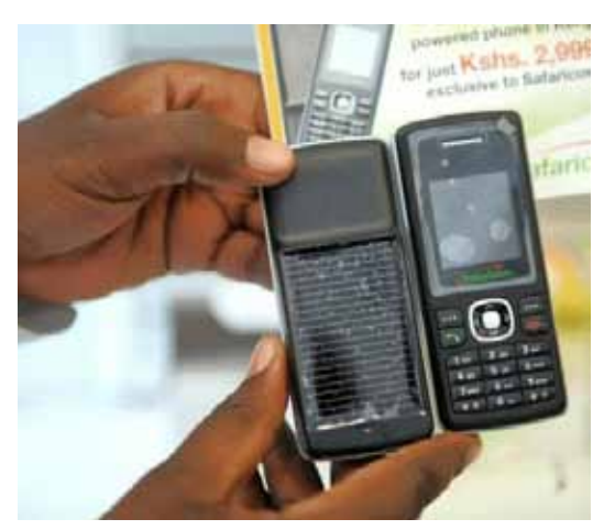
The 'Simu Ya Solar': solar phone launched by Safaricom