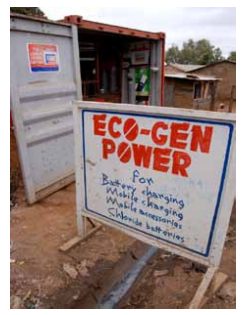
Sign and entry to the Eco-Gen Power charging shop (Kibera, Kenya)

A GSMA field study in Kibera, Kenya (Nairobi's largest slum) indicated that the price of a mobile charge was KES 20 (approximately US$0.25) and required an average of two hours to complete. The frequency of charges per customer ranged between one per day on the high end and once per week on the low end. Presuming an average of three charges per consumer per week (twelve charges per month) it appears that the typical mobile consumer in Kibera spends US$3.00 on charging per month. This is a notable sum, given that the same customers spend between KES 4-16 (US$0.18-US$0.21) per minute for voice calls (depending on the tariff and time of day) and a monthly total of KES 400-500 (US$6.00) per month on airtime. The implication is that one third of total spend by off-grid mobile subscribers goes on power, rather than airtime.