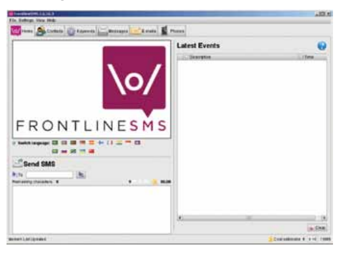
Figure 9: SendConsole screen – compilation and sending of group messages<sup>53</sup>

FrontlineSMS does not require an internet connection for either the administrator or the subscribers which means it can be deployed in rural areas of Africa where internet access is still rather limited. The application has proven to be a powerful tool for development in a variety of contexts ranging from health issues to community radio stations or the provision of legal advice and resources. <sup>51</sup> Programmers are constantly incorporating new features and bug fixes, thereby providing localised solutions geared to local needs. <sup>52</sup>